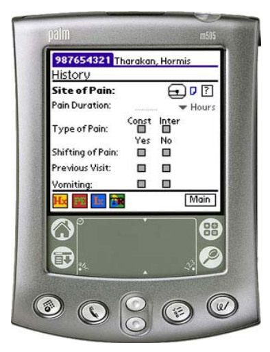
Figure 4. History screen.