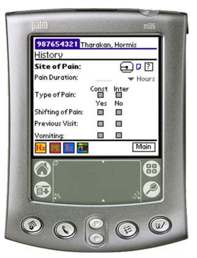
Figure 6. Selecting an attribute.