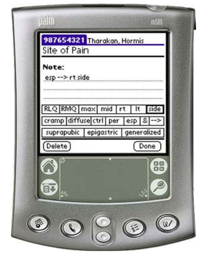
Figure 9. Writing comments.

set of frequently used terms and keywords and implemented them as small buttons located at a bottom of the comments screen (that is accessible for almost all clinical symptoms and signs used in the system). The physician simply needs to tap on the varying buttons to create a simplified statement (see Figure 9).